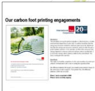
Carbon footprinting for the International Post Corporation