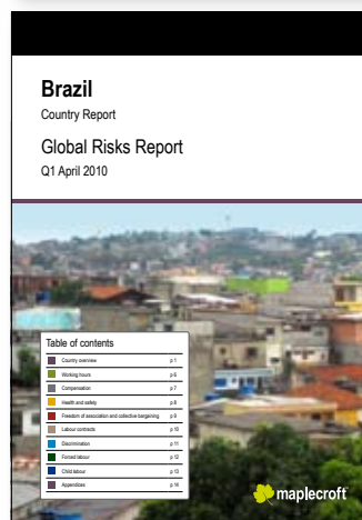
In-depth ESG analysis of key economies