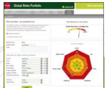
Maplecroft risk calculator

Exploring dilemmas for multinational corporations with the UN Global Compact