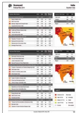
Political risk scorecard and sub-national map of terrorism in India

The Global Risks Portfolio is the gateway to over 100 indices and interactive maps, plus country scorecards, briefings and in-depth reports.