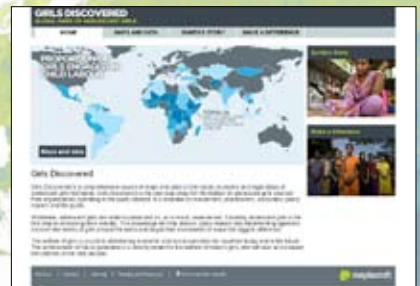
Mapping the global development of girls in partnership with the Nike Foundation and the UN Foundation