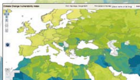
Sub-national mapping of climate change vulnerability down to 25km 2