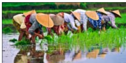
Human Rights and Business Dilemmas Forum Dilemmas confronting business in their efforts to respect and support human rights

Exploring dilemmas for multinational corporations with the UN Global Compact